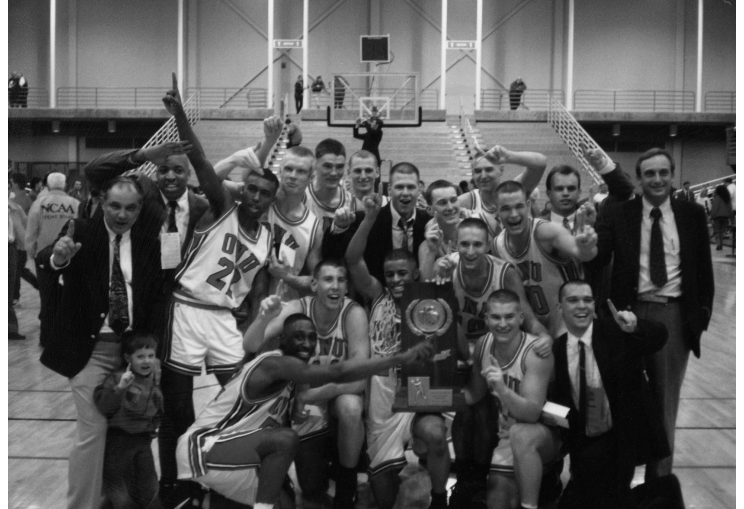
ONU: 1992-93 NCAA national champions