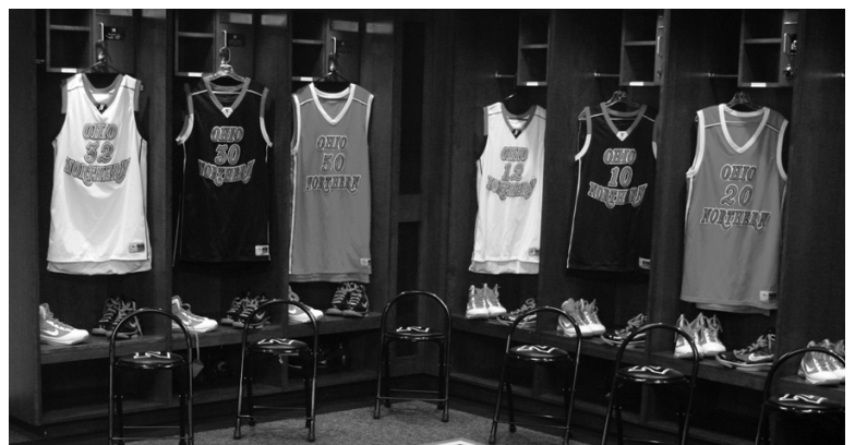
Renovated Men's Basketball Locker Room in King Horn Center